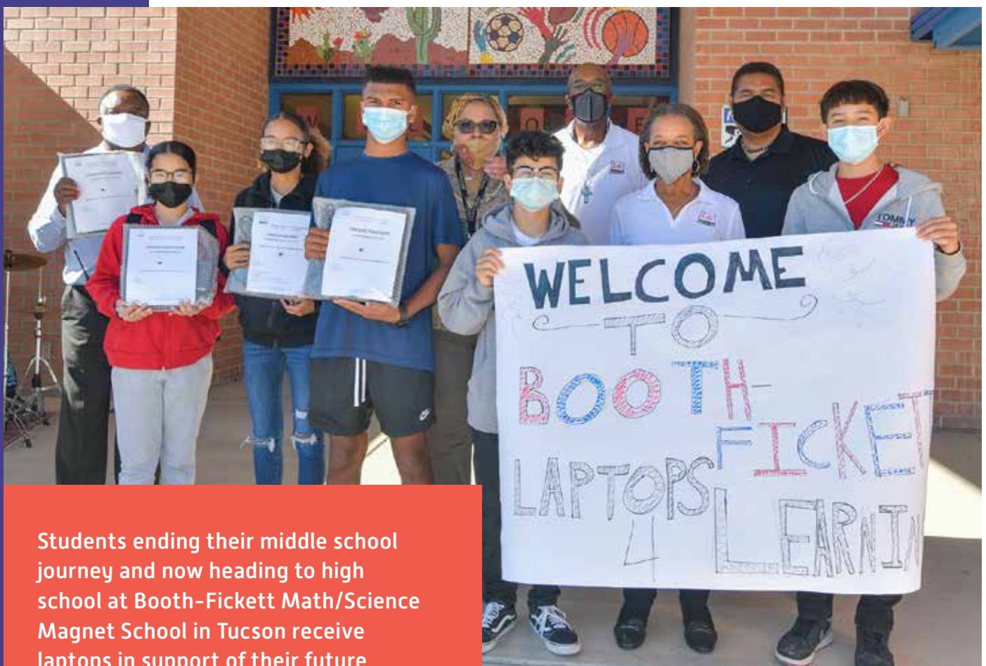
Students ending their middle school journey and now heading to high school at Booth-Fickett Math/Science Magnet School in Tucson receive laptops in support of their future success in school.

L4L has observed that program participants tend to have a greater appreciation for a device to which they have personally invested time, money and energy. However, we recognize that for many families, particularly those with multiple children, it is a financial hardship to purchase even one laptop. "Match Funds" allows L4L to offer support to a greater number of students and their families.